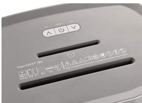
DAHLE PaperSAFE® document shredder 380